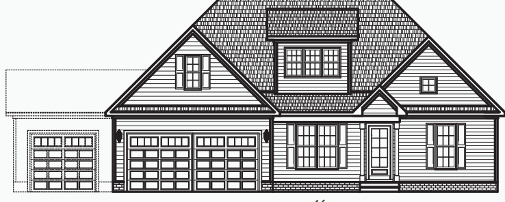
TRADITIONAL with BRICK